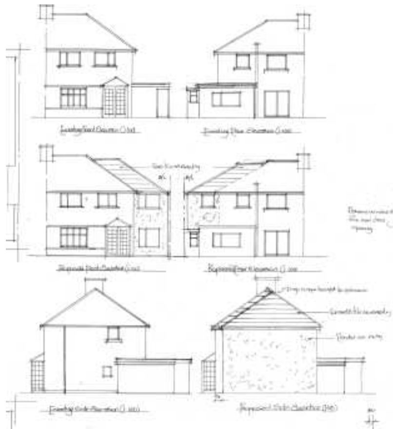
Scheme as Proposed

The proposed extension will no longer be a prominent addition to the streetscene, given its reduction in height, width and depth and it will not detract from the character and appearance of the existing dwellinghouse or wider streetscene.